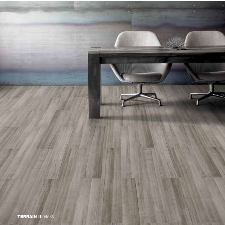
TERRAIN II 0454V